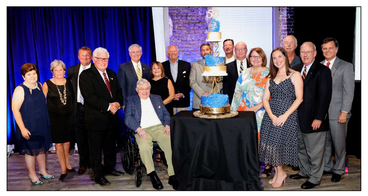
MCEDA and Port Authority Board members pictured with the MCEDA Team and 50th Anniversary Celebration Cake.

Other activities included a tribute video of EDA's history, a celebratory anniversary cake, as well as displays throughout the venue showing past and present industries, key players in economic development, important events over the past 50 years, and the development and success of local industrial parks such as Mallard-Fox Creek and Morgan Center Business Park.